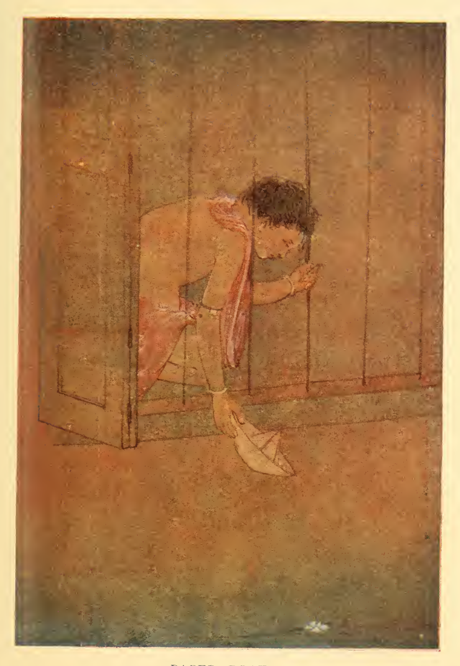
PAPER BOAT. From a drawing by Surendranath Ganguli.